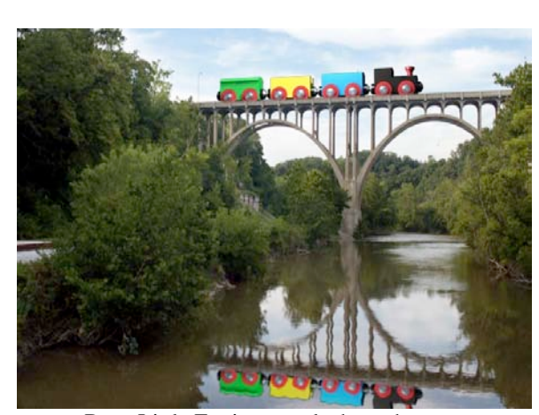
Busy Little Engine travels through many interesting landscapes on his adventures. Here, Busy Little Engine crosses a very tall bridge.