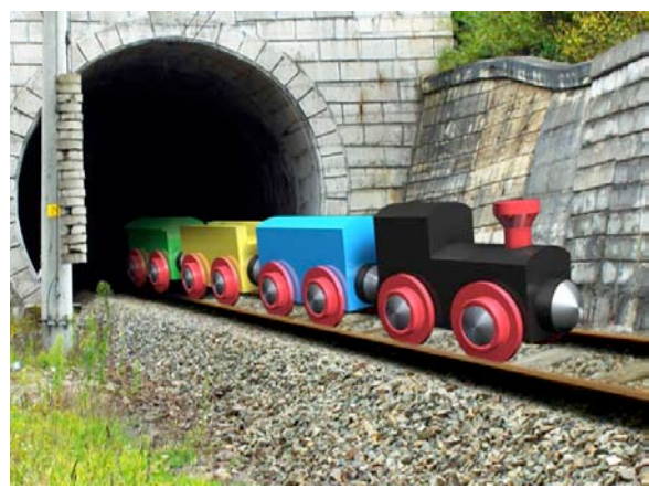
With a little help from the narrator, Busy Little Engine and Pig start on an adventure using their imaginations to learn about real trains.